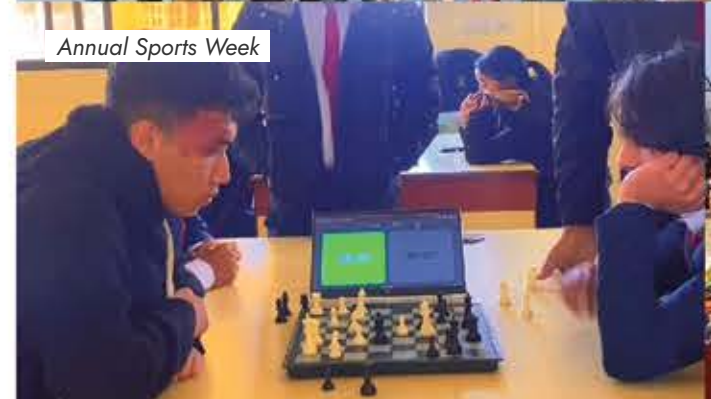
Annual Sports Week