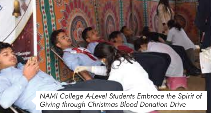
NAMI College A-Level Students Embrace the Spirit of Giving through Christmas Blood Donation Drive