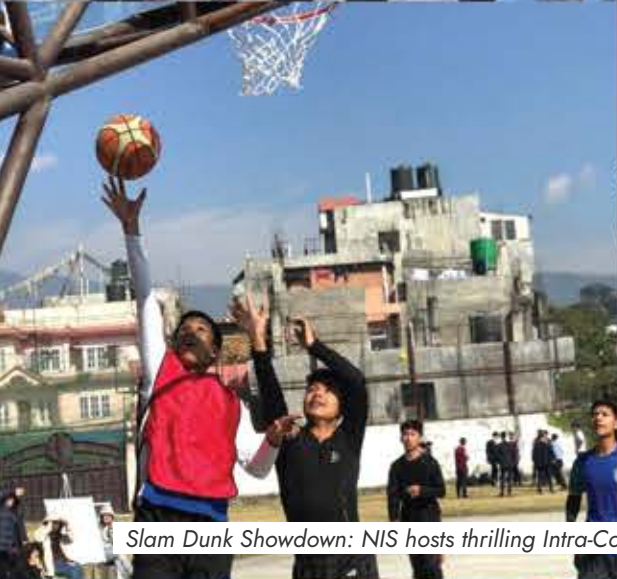
Slam Dunk Showdown: NIS hosts thrilling Intra-College Basketball Tournament