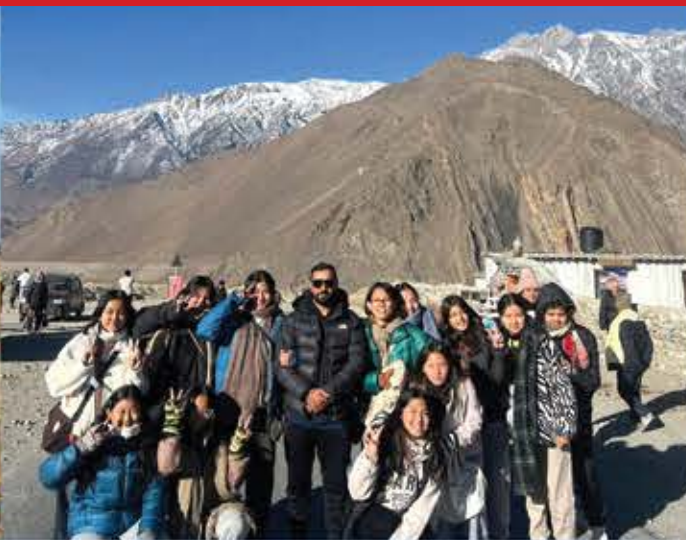
Social Camp at Shree Ganesh Basic School in Sindhupalchowk