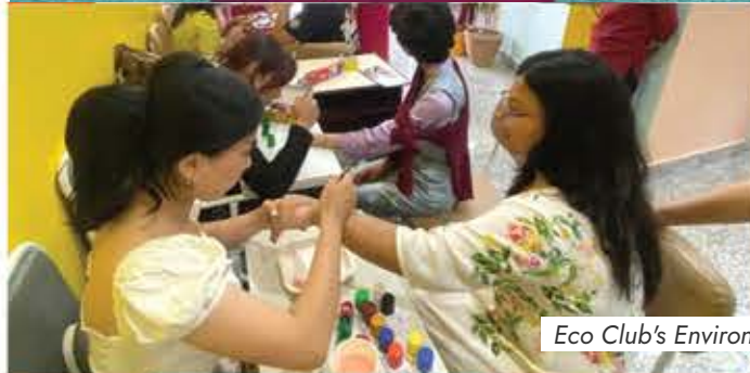
Eco Club's Environment Day Program