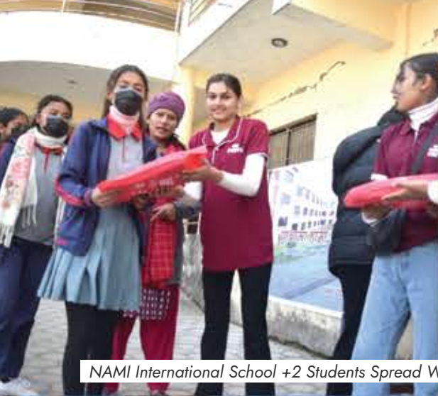
NAMI International School +2 Students Spread Warmth Through Donation Drive