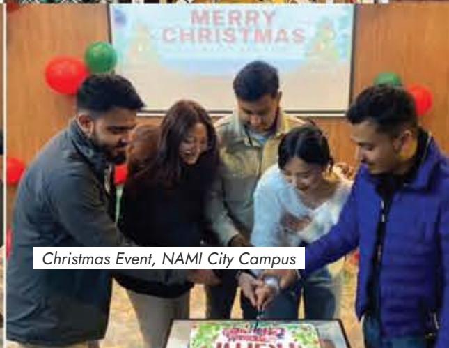
Christmas Event, NAMI City Campus