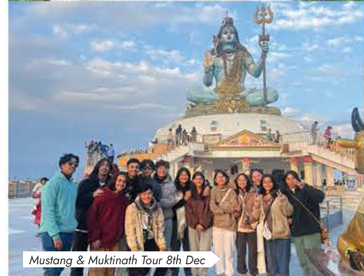
Mustang & Muktinath Tour 8th Dec