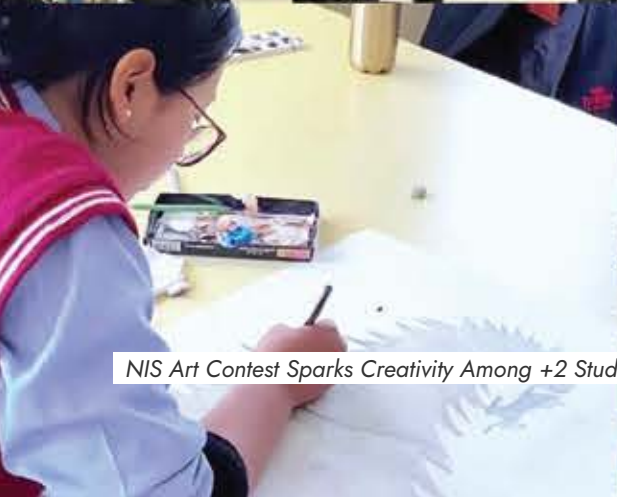
NIS Art Contest Sparks Creativity Among +2 Students