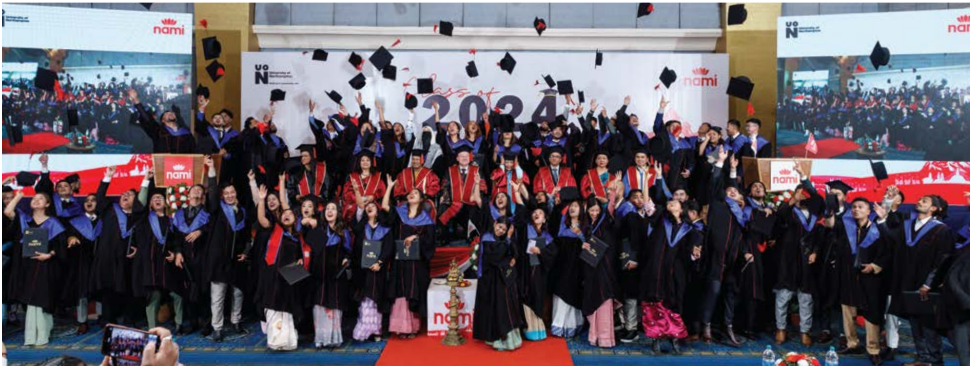
Class of 2024 Convocation