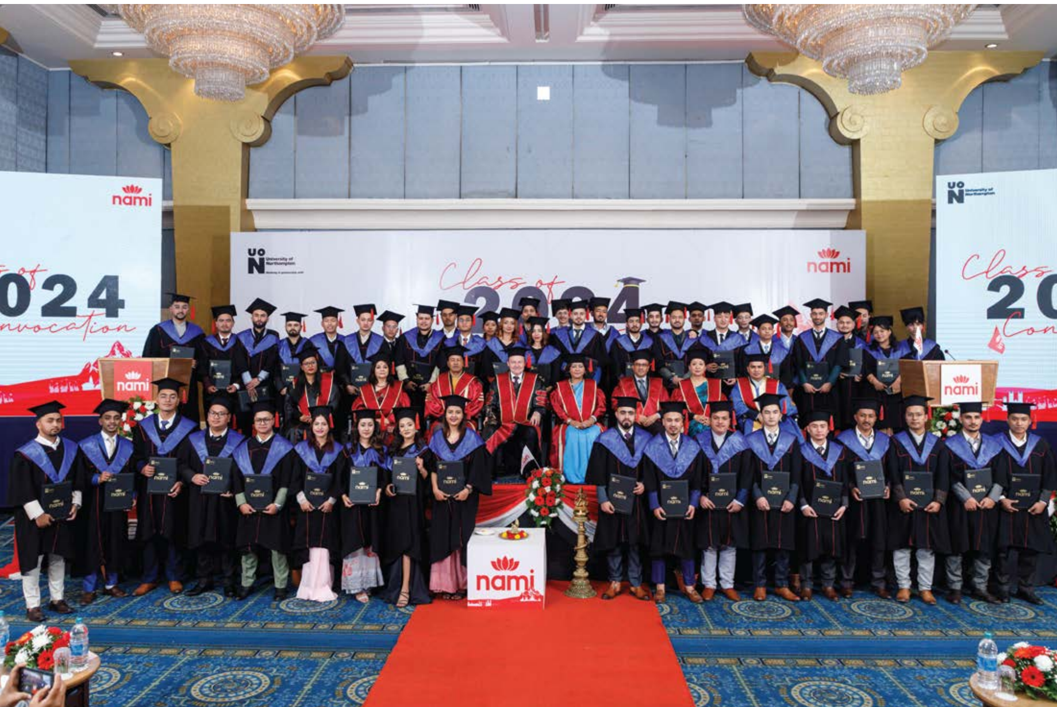
Class of 2024 Convocation