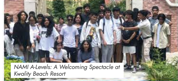
NAMI A-Levels: A Welcoming Spectacle at Kwaliti Beach Resort